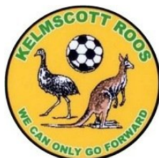
Previous league games against Kelmscott Roos